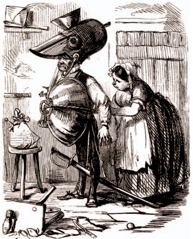
A Physical Force Chartist arming for the fight, as satirised in Punch .

And the Reasoner added: 'He was a clever, industrious, honest, sober and frugal man.' A profile of Cuffay in Reynold's